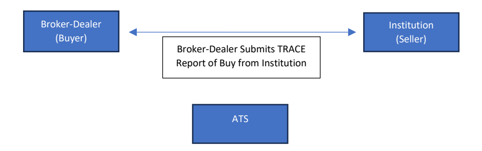
Diagram 2: TRACE Reporting with FINRA Rule 6732

Diagram 2 illustrates TRACE reporting where an ATS has received a TRACE exemption from FINRA pursuant to FINRA Rule 6732. In this scenario, the ATS is not required to report to TRACE, and the broker-dealer submits a TRACE report showing a purchase from the institution. This TRACE report also identifies the ATS. FIF members request for FINRA to provide written guidance that, in this scenario, the broker-dealer is not responsible to pay the TAF as the TAF will be paid by the ATS.